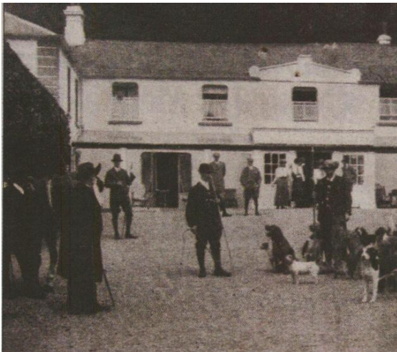
■ The Woodenbridge Hotel in days of yore.

The Woodenbridge Hotel is situated five miles from Arklow on the R747. For further information email info@woodenbridgehotel.com , telephone 0402 35146, see www.woodenbridgehotel.com or fax 0402 35573.